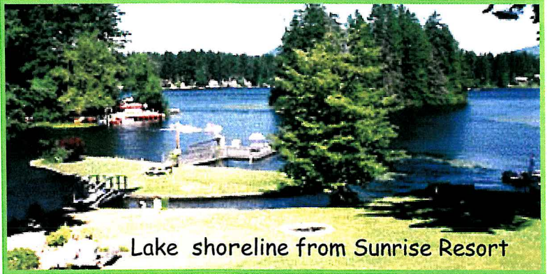
Lake shoreline from Sunrise Resort

To manage shoreline development and uses, the State Legislature passed the Shoreline Management Act in 1971. The law intended a cooperative relationship between local governments and the State Dept. of Ecology in the management of most streams, lakes larger than 20 acres, marine waters, and associated shorelines, wetlands, and flood plains.