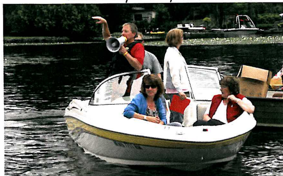
Lake Sawyer Community Club