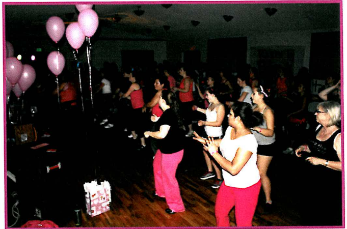
Susan G. Komen—Zumba Fundraiser